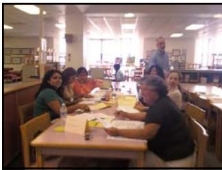
NM ELD Standards Alignment Study in Bernalillo, NM July 2009

educators and partner organizations in attendance.