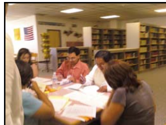
9-12 grade alignment study group in Bernalillo, NM July 2009

Our role as educators is to ensure that the transition and implementation of the new ELD Standards is successful in order to close the achievement gap for all learners.